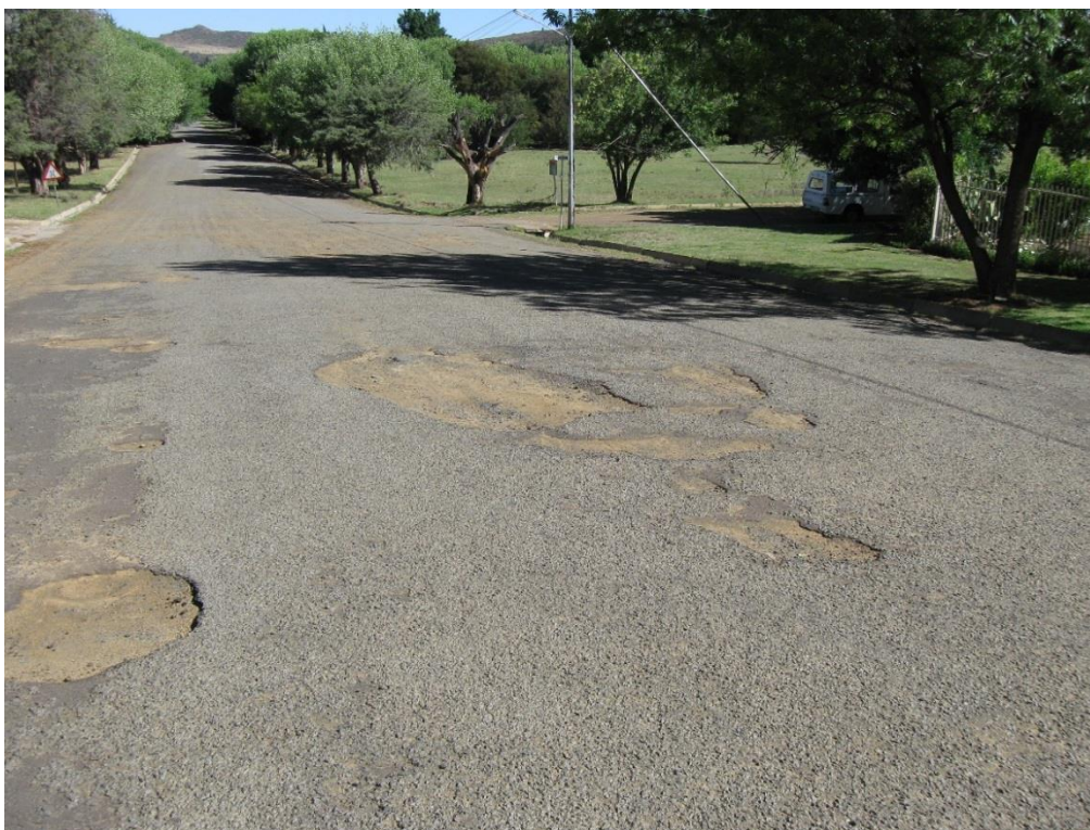
Photograph 10: Many streets in Zastron are breaking up. Urgent maintenance is required before the situation gets worse and major reconstruction becomes necessary.