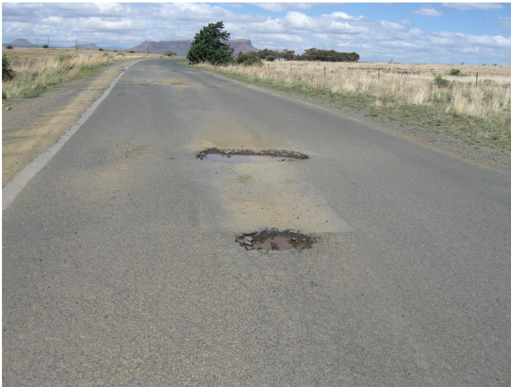
Photograph 8: Potholing of the main access road from R26 to Zastron. Reconstruction will be necessary in places.

Photographs 8 to 14 illustrate some of the problems.