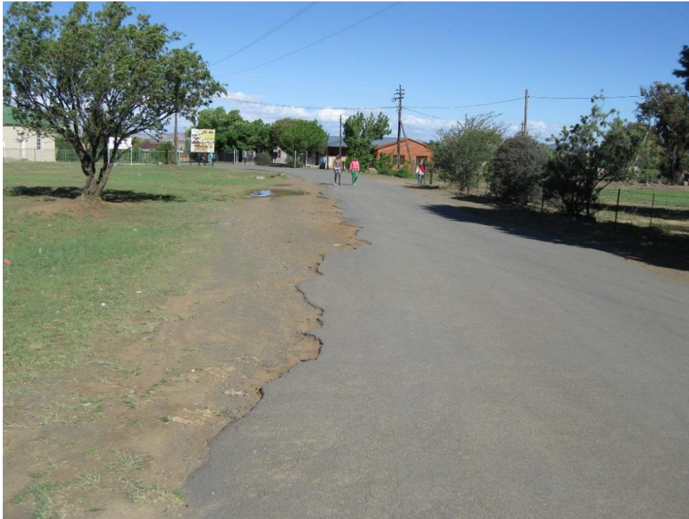
Photograph 13: This surfaced road in Matlakeng has been neglected and major repair work is required.