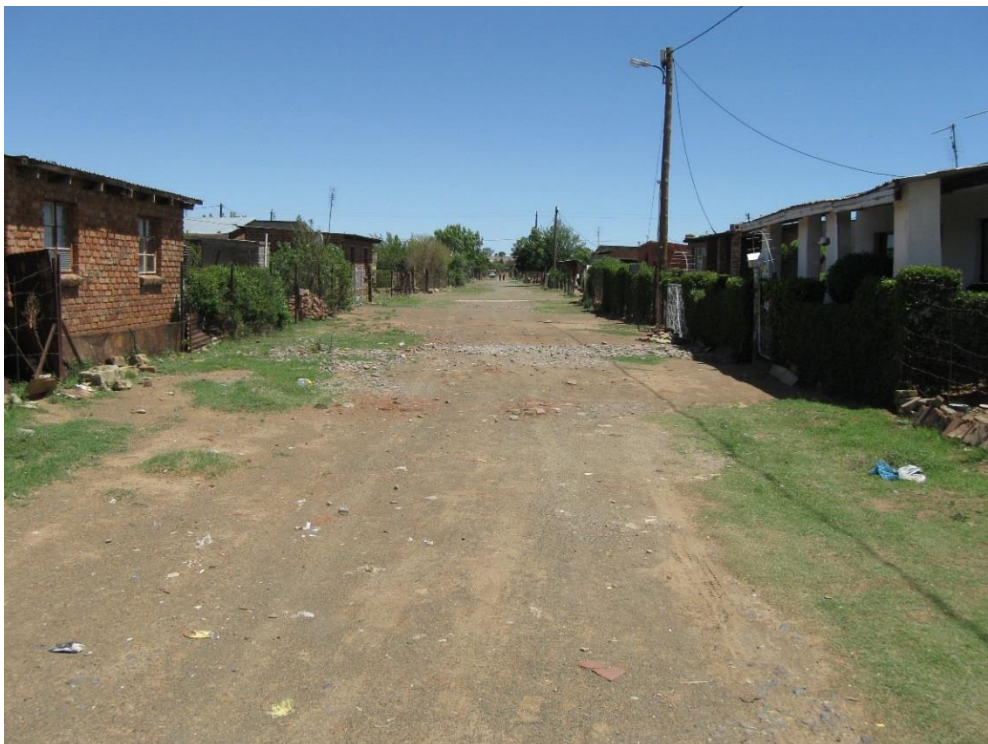
Photograph 7: This gravel track in Roleleathunya is eroded and needs to be gravelled and properly shaped in order to facilitate efficient drainage.