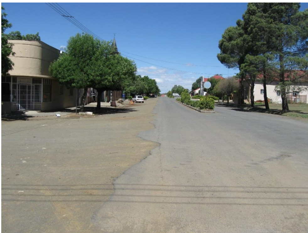
Photograph 5: Edge break at a surfaced road in Rouxville. This requires urgent repair in order to prevent further damage.