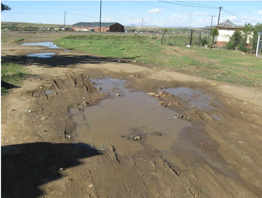
Photograph 8: Example of non-existent stormwater drainage in Matlakeng. This problem is common in the townships and can be alleviated by re-gravelling and shaping the road and constructing lined drains.