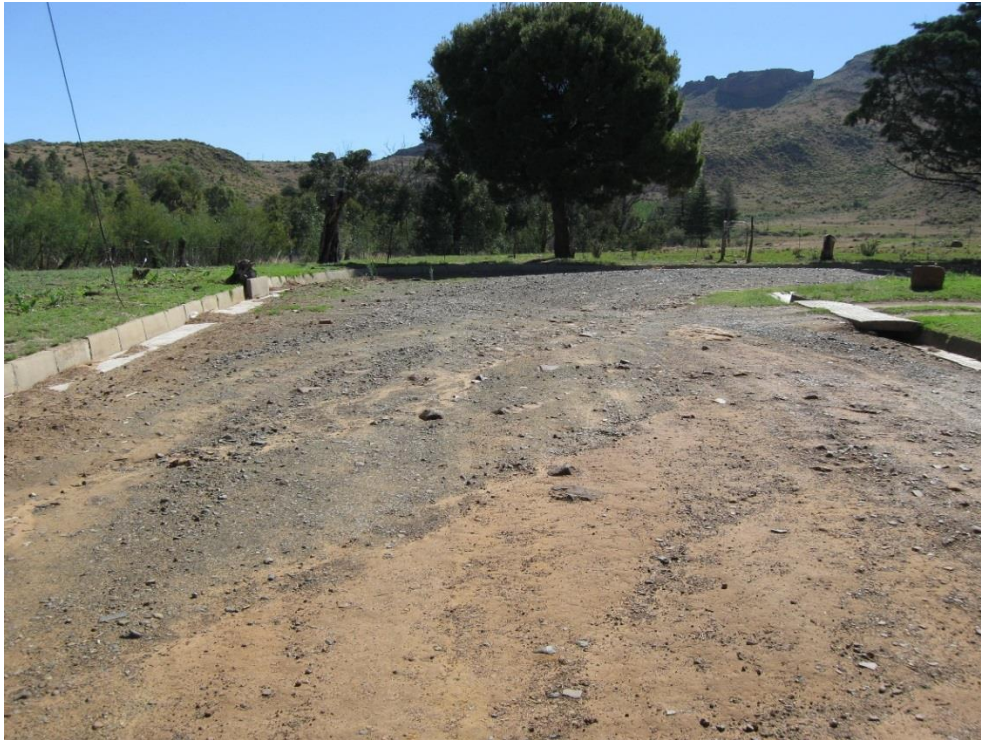
Photograph 11: Van Riebeeck Street in Zastron is eroded in places. Gravel roads with steep slopes should rather be paved. Concrete block paving is recommended.