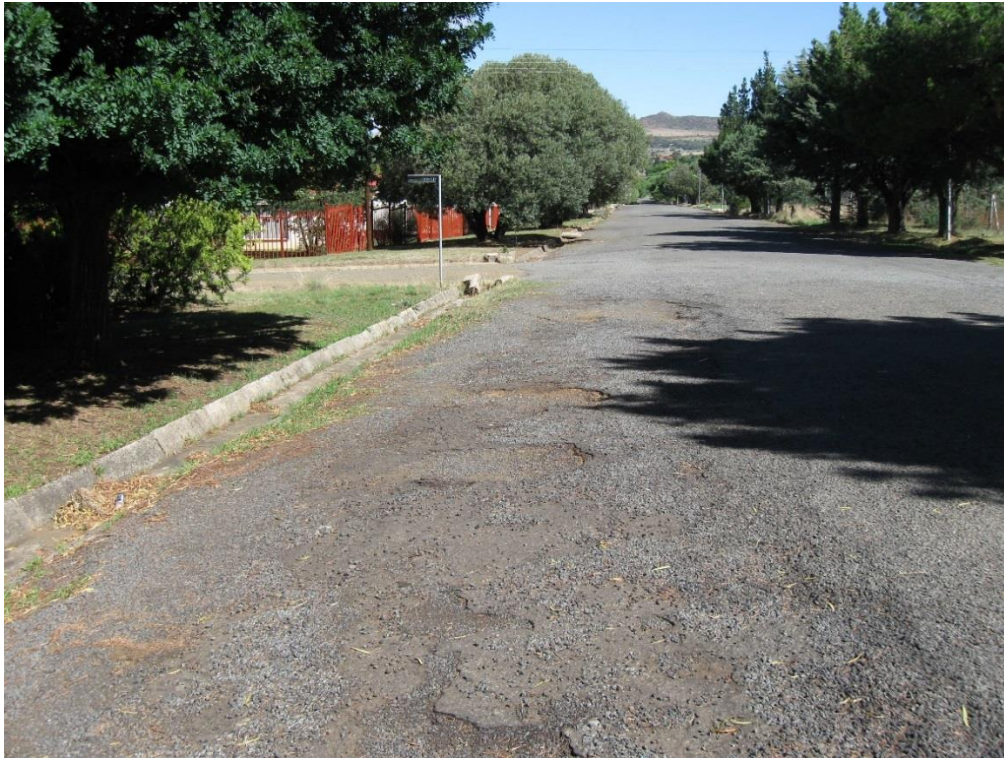
Photograph 9: The street outside the hospital is breaking up and needs maintenance urgently.