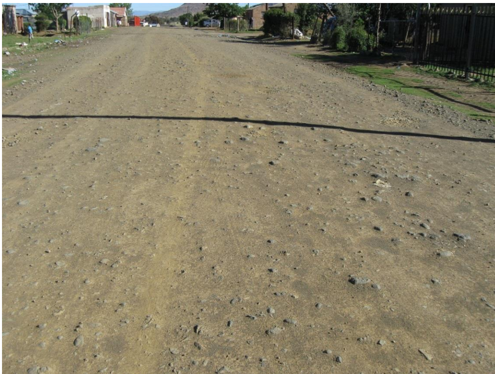
Photograph 14: This is a typical gravel street in Matlakeng. It is eroded and inconvenient for cyclists and pedestrians. Re-gravelling should be undertaken.