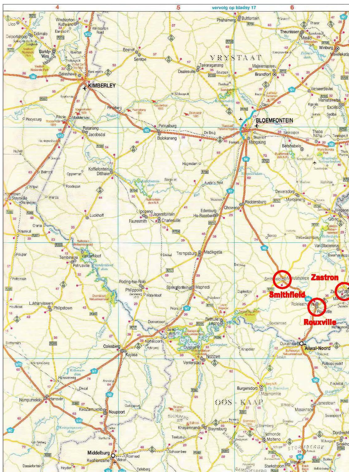
Figure A2: Road map of the towns comprising Mohokare LM