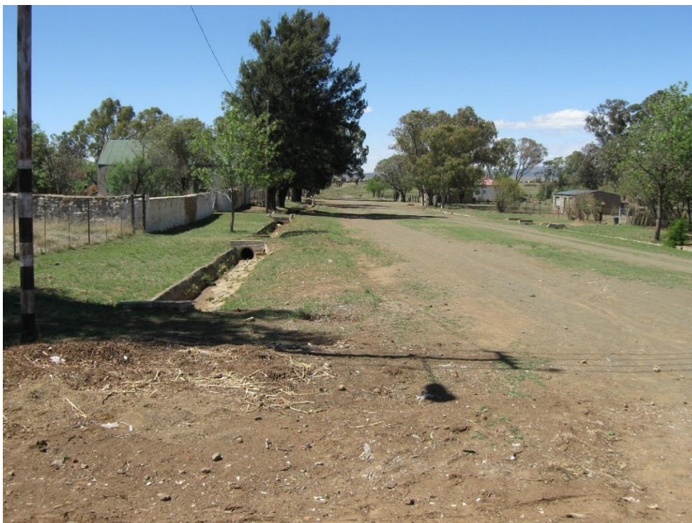
Photograph 6: Street in Rouxville. The verge needs to be trimmed and shaped in order to facilitate proper drainage.