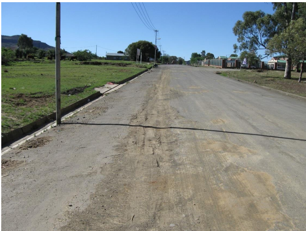
Photograph 12: The main access road between Zastron and Matlakeng can no longer be patched and reconstruction is required.