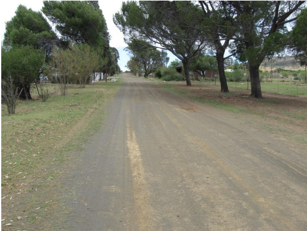
Photograph 1: Typical gravel road in Smithfield (good condition).