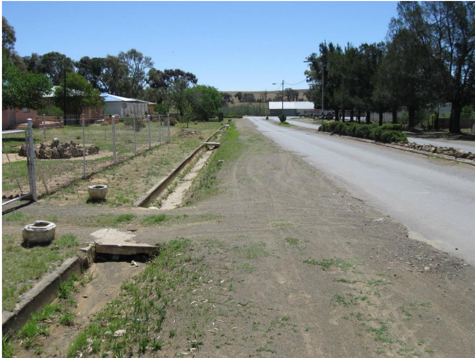
Photograph 4: This street in Rouxville needs shaping of the verge in order to facilitate proper drainage.