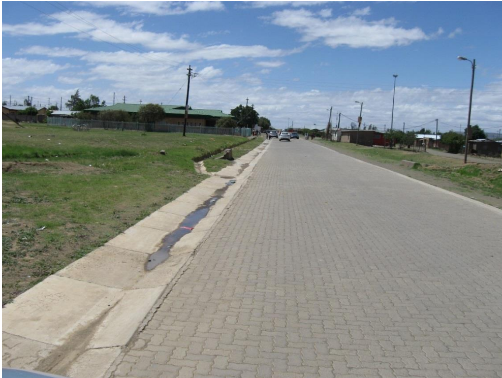
Photograph 6: Posholi Street in Roleleathunya is constructed of concrete block paving and is in very good condition. This type of construction is recommended.