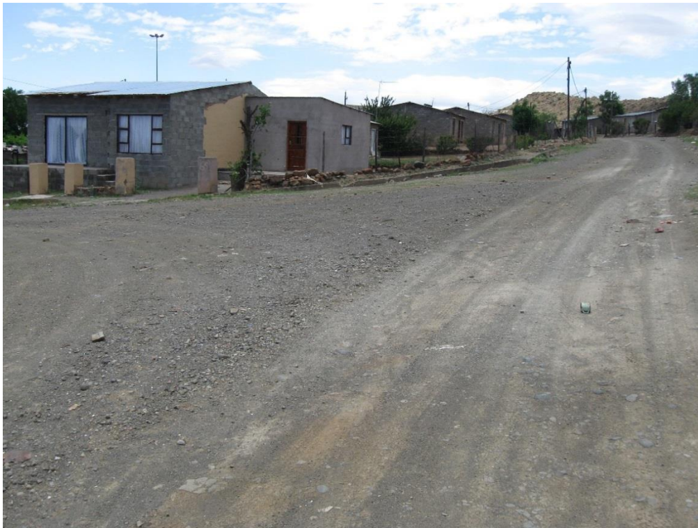
Photograph 2: Gravel roads on steep slopes are subject to erosion, as this street in Rietpoort shows.