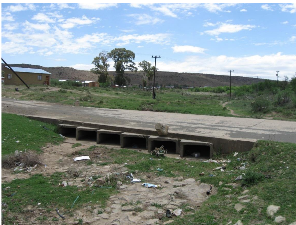
Photograph 3: The low-level crossing of Kerk Street over the Groenspruit in Mofulatshepe.