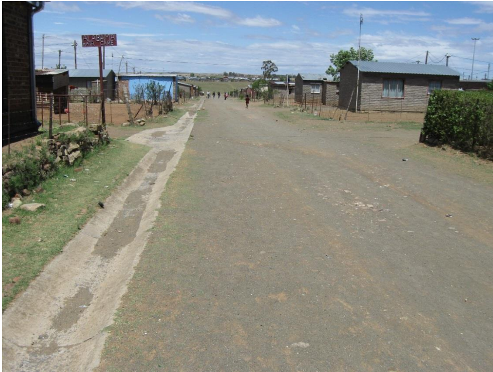
Photograph 5: Gravel street in Roleleathunya. The road is not properly shaped so the channel does not drain the road effectively – grass grows where the water ponds.