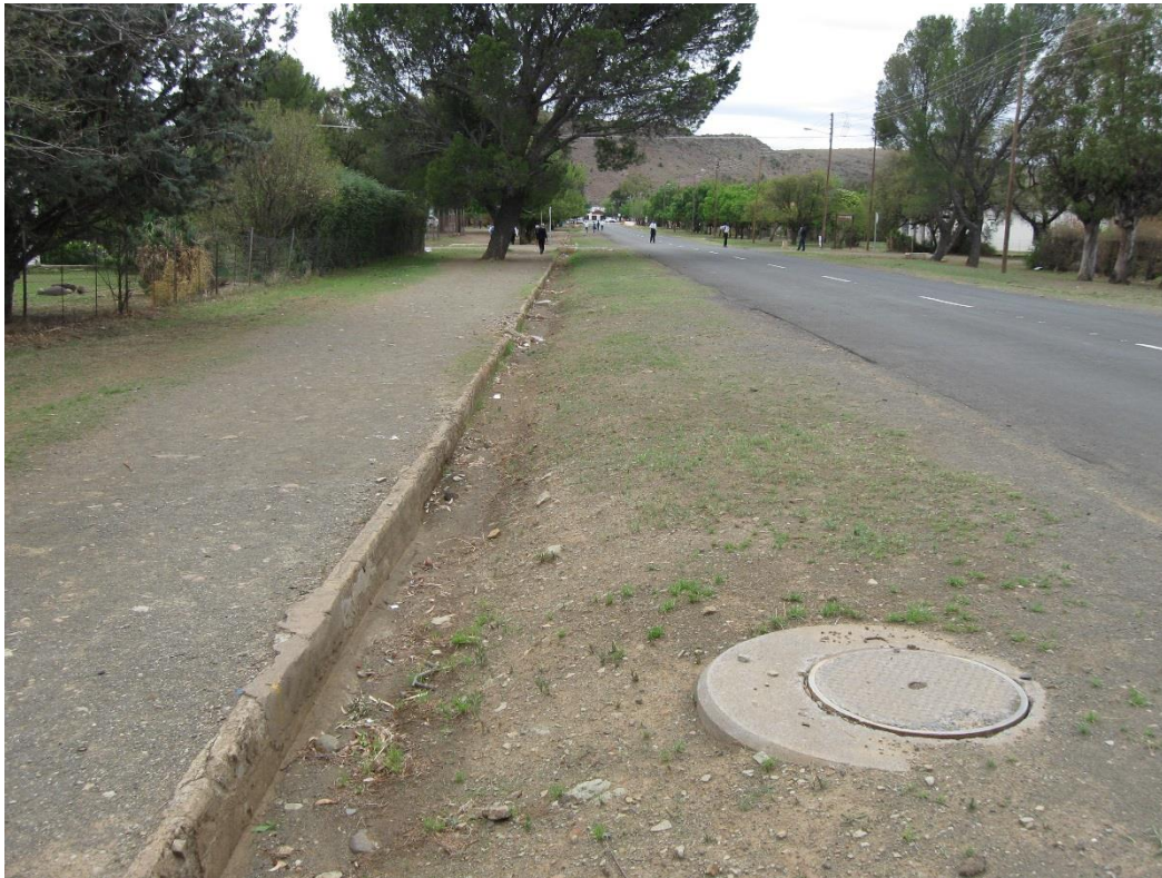
Photograph 1: Typical stormwater channel in Smithfield.

Photograph 3 shows the low-level crossing of the Groenspruit (extension of Kerk Street) in Mofulatshepe/Rietpoort. The culvert openings are clearly too small and the crossing is subject to frequent flooding. As mentioned, this section of road should be upgraded urgently. Photograph 4 illustrates the natural size of the Groenspruit further north in Mofulatshepe.