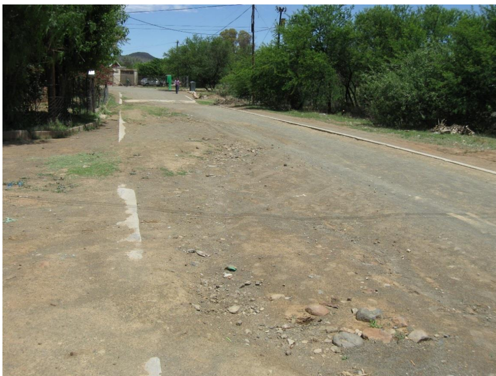
Photograph 2: Proper shaping of gravel roads and channels is required in Mofulatshepe and Rietpoort. Channels should preferably be lined.