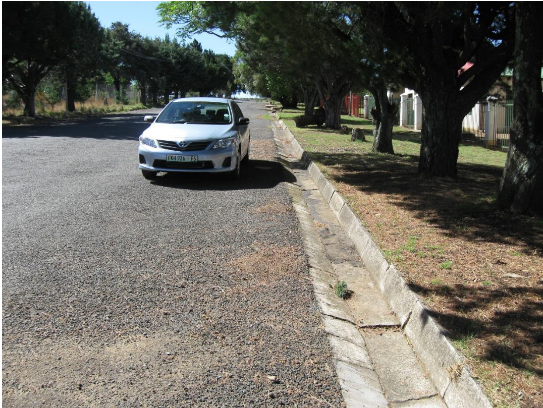
Photograph 7: An example of a good drainage channel in Zastron.

Drainage in Zastron is typically via lined channels adjacent to the roads, as shown in photograph 7. These appear to be working well, although some maintenance is required in a few places. In contrast to this, drainage in Matlakeng and Refengkgotso is rudimentary, and in many cases non-existent. This is a cause of great inconvenience to pedestrians and cyclists. Re-gravelling and shaping of roads and construction of lined channels will alleviate this problem. Photograph 8 illustrates the problem of poor drainage.