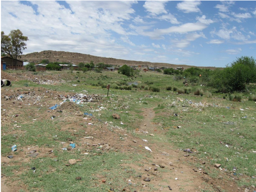
Photograph 4: The Groenspruit in its natural state in Mofulatshepe. This should be compared with the small opening allowed under Kerk Street (photograph 3 above).