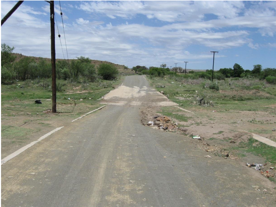
Photograph 3: The section of Kerk Street over the Groenspruit in Mofulatshepe is subject to frequent flooding and should be upgraded urgently.